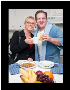
FROSTY FLAKER C.E.O. of K-Legs Cereal

Roman toga. An optional cowboy hat and bandana scarf as optional accessories.