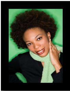
ALOTTA BUTIES Beauty Pageant Director

Roman toga. An optional toy gun strapped to your leg as an optional prop.